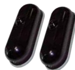
PHOTOCELL P27S transmitter+ receiver