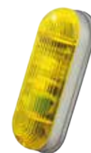
MICRO-FLASH flashing lights