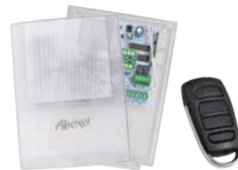
KIT - control unit for motorized rolling shutters SH230LUX + tx SH4