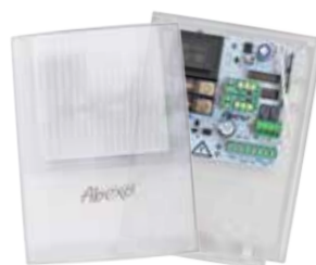
SH230LUX - Control unit for motorized rolling shutters