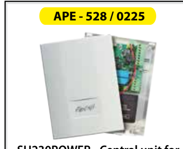
SH230POWER - Central unit for motorized rolling shutters